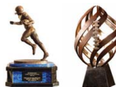
2010 John Mackey Award 2010 Disney Spirit Award