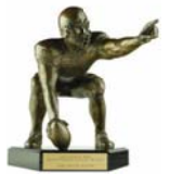
2007 Rimington Trophy 2007 Consensus First Team All-American