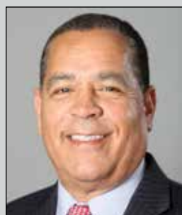
KELVIN SAMPSON Head Coach 4th Season at Houston 29th Season Overall