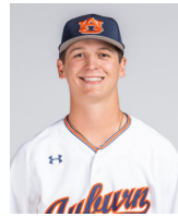
21 TRACE BRIGHT