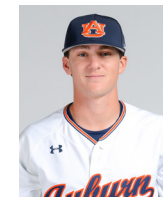
37 MASON LAND