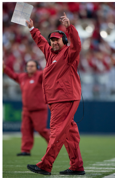
Arkansas has won three straight against Ole Miss under head coach Bret Bielema. All three wins have come against a ranked Rebels squad, highlighted by a 53-52 overtime victory in Oxford, Mississippi, in 2015.