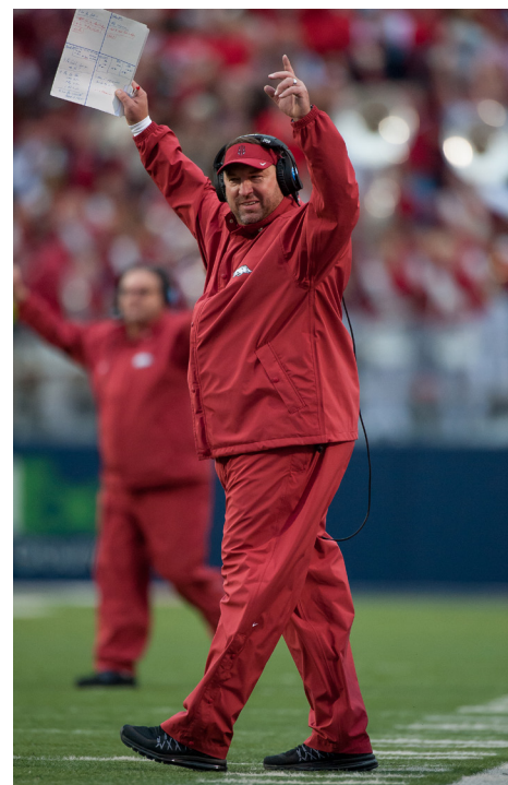
Arkansas is 5-5 on the road in the SEC over the last three seasons, including a 3-1 mark in the month of November. Head coach Bret Bielema is 26-14 all-time in November.