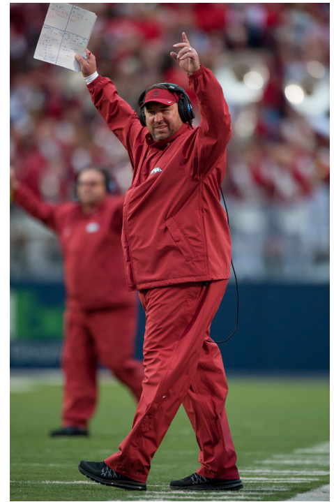
Arkansas is 5-5 on the road in the SEC over the last three seasons, including a 3-1 mark in the month of November. Head coach Bret Bielema is 27-14 all-time in November.