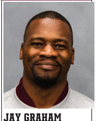
CO-OFF. COORD/RUNNING BACKS