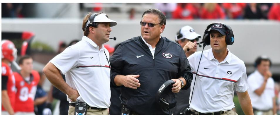
Kirby Smart, Sam Pittman and Shane Beamer

♦ For the second-straight week, South Carolina head coach Shane Beamer will be facing a former colleague. Coach Beamer and Sam Pittman were on the Georgia staffs together under head coach Kirby Smart for the 2016 and 2017 seasons. The 2016 squad went 8-5 and defeated TCU in the Liberty Bowl. The 2017 Bulldogs defeated Oklahoma in the Rose Bowl, then lost to Alabama in the CFP Championship game by a 26-23 score to finish 13-2. Last week, Coach Beamer faced Georgia State head coach Shawn Elliott. Both were on the 2010 South Carolina staff under head coach Steve Spurrier.