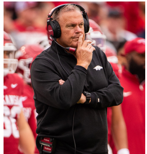
Sam Pittman is the fourth Arkansas head coach in history to lead the Razorbacks to bowl eligibility in each of their first three seasons, joining Lou Holtz, Ken Hatfield and Houston Nutt.