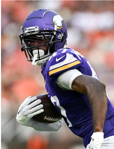
As of Nov. 10, 2024