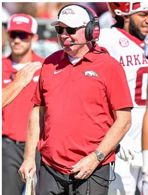
Arkansas has posted three top 10 total offense efforts in Bobby Petrino's return as offensive coordinator.

• The Razorbacks' 673 yards of total offense at Mississippi State (Oct. 26) was their second-most against a conference opponent in program history and good for seventh on the all-time chart.