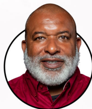
RONALD MCKINNON LINEBACKERS FIELD