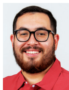
JP SINUK Creative Media