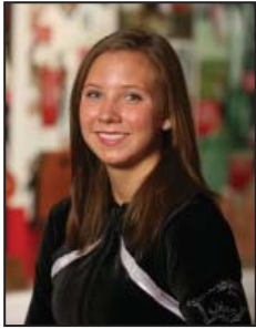
FIRST-TEAM AMERICA ALL-AMERICA 2008

To be named as an All-American, athletes must be at the NCAA Championship competition. Places 1-4 (plus ties) in each event and the all-around in each session of Thursday's preliminary team competition are considered first-team All-Americans. Places 5-8 (plus ties) are considered second-team All-American.