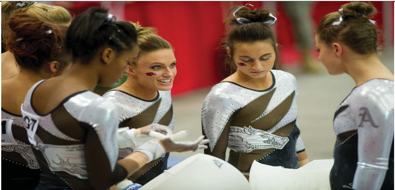
GYMBACKS IN FAYETTEVILLE AT THE REGIONAL