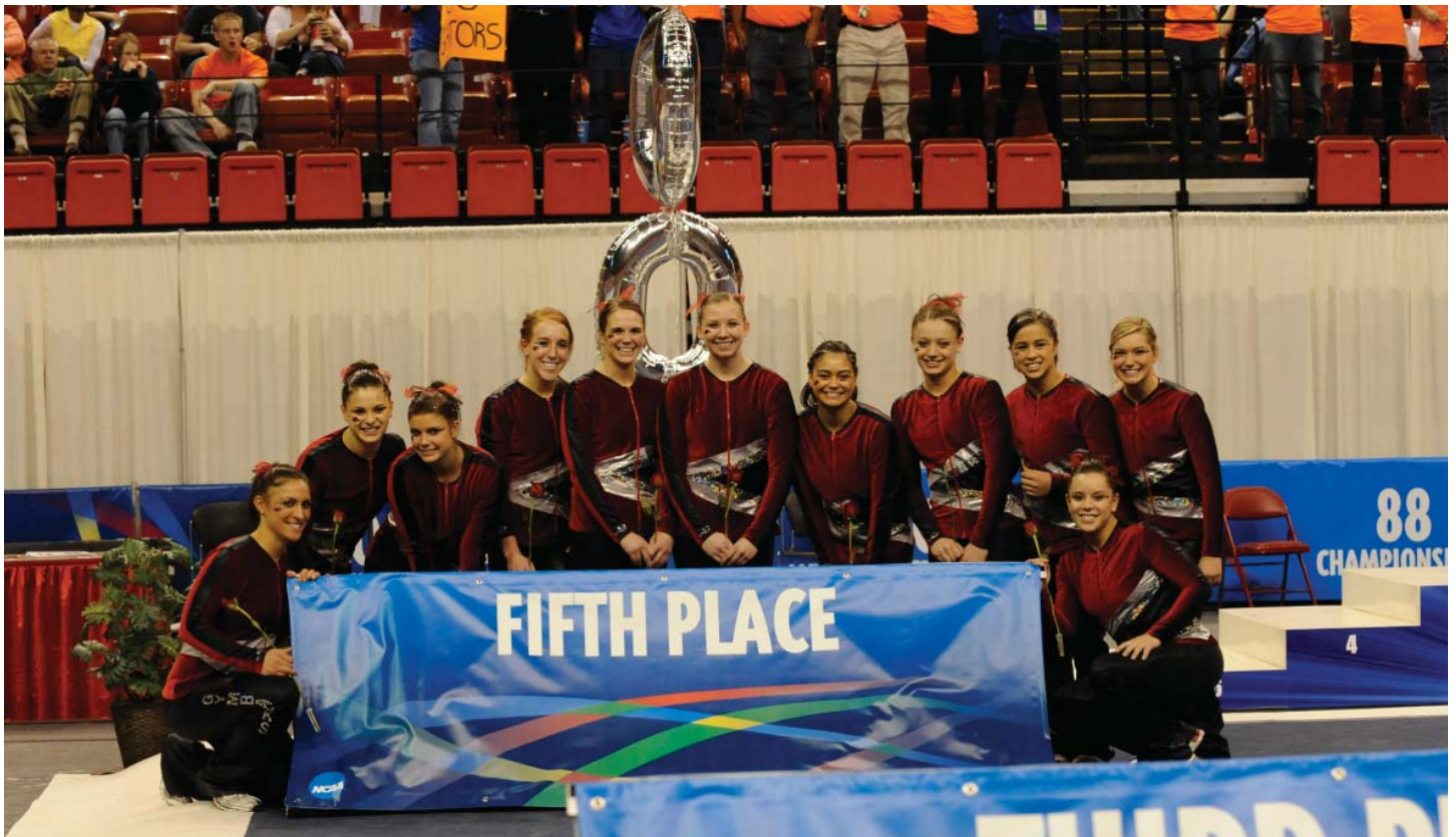
THE GYMBACKS HIGHEST FINISH IN 2009 – 5TH PLACE