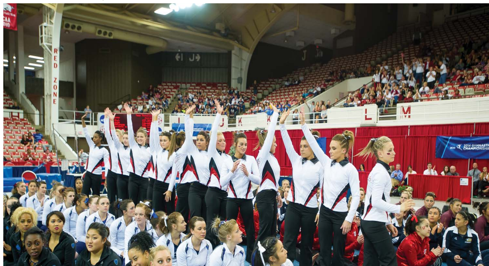
Arkansas at 2013 NCAA Regionals