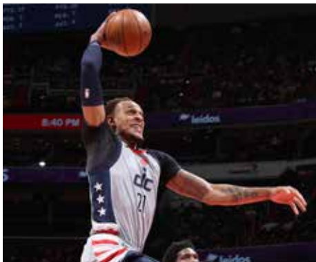
DANIEL GAFFORD | WASHINGTON WIZARDS 2019 2nd Round Draft Pick