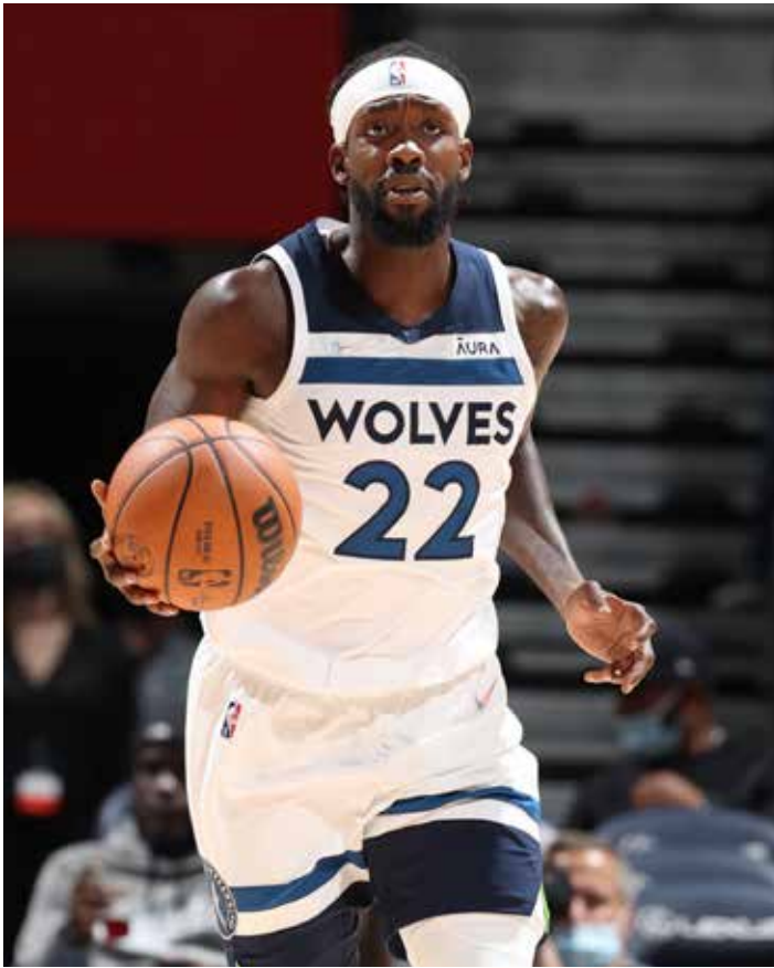
PATRICK BEVERLY | MINNESOTA TIMBERWOLVES 3-Time NBA All-Defensive Team / 2009 2nd Round Draft Pick