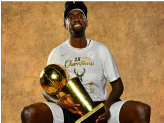
BOBBY PORTIS | MILWAUKEE BUCKS 2021 NBA Champion / 2015 1st Round Draft Pick