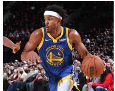
MOSES MOODY | GOLDEN STATE WARRIORS 2021 1st Round Draft Pick / Arkansas' 1st One & Done