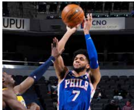
ISAIAH JOE | PHILADELPHIA 76ERS 2020 2nd Round Draft Pick