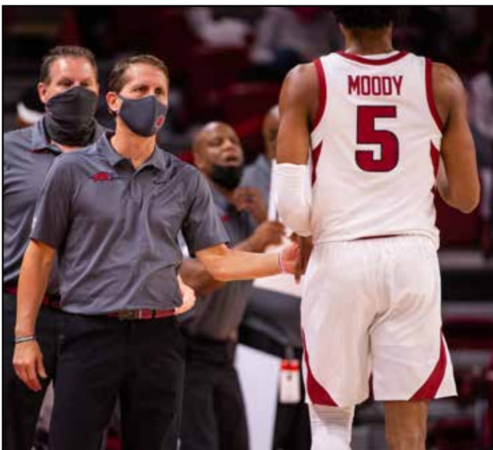
Eric Musselman helped Moses Moody be the 2021 SEC Freshman of the Year, an NBA Lottery pick and the school's first "one-and-done."

Musselman's father Bill was also an collegiate and NBA head coach and they were the first father-son combination to become head coaches in the NBA.