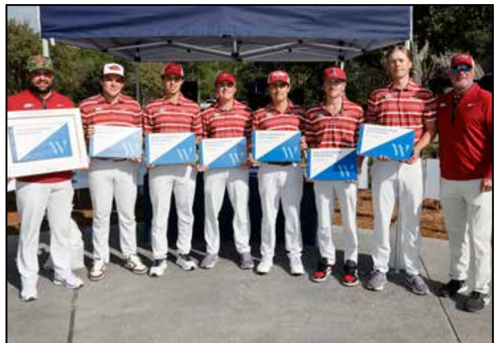
2026 WATERSOUND INVITATIONAL CHAMPIONS