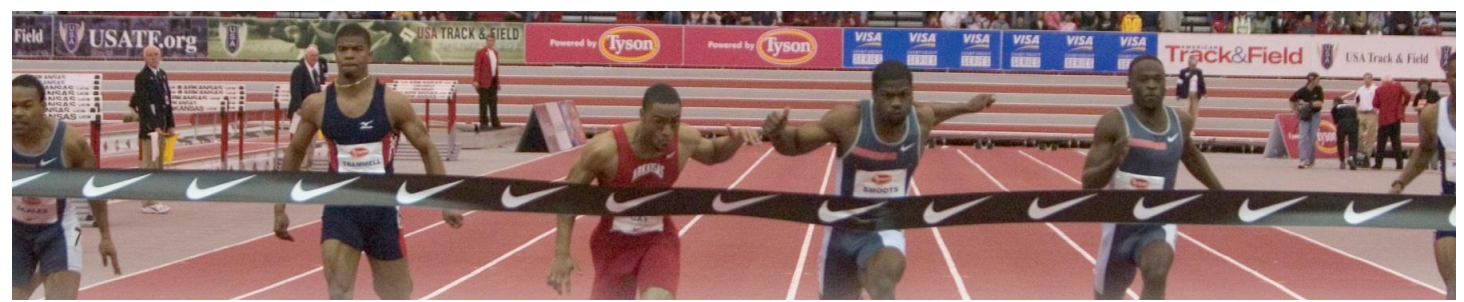
RANDAL TYSON TRACK CENTER

Originally built by Mondo for the World Championships in Toronto, Canada the Tyson track first became available for Arkansas athletic use in 2000. Since the opening of the center, Arkansas has hosted seven SEC Championships and 13 NCAA Championships at the facility.