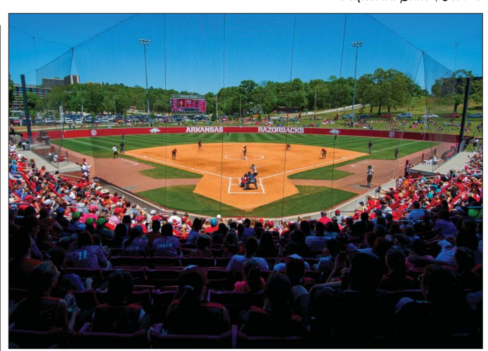
As part of the their 2018 schedule, the Razorbacks are set to play 25 home games at Bogle Park and will face 12 teams overall that played in last year's NCAA Tournament including five that advanced to the Super Regionals.