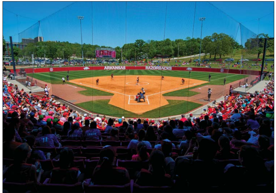
As part of their 2018 schedule, the Razorbacks are set to play 25 home games at Bogle Park and will face 12 teams overall that played in last year's NCAA Tournament including five that advanced to the Super Regionals.