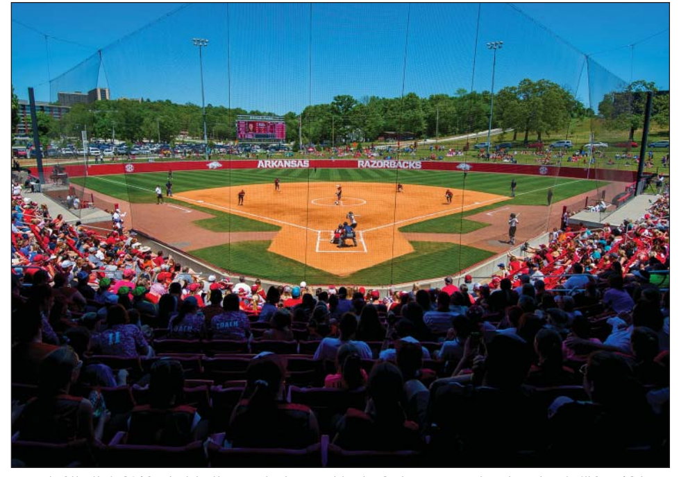
As part of the their 2018 schedule, the Razorbacks are set to play 25 home games at Bogle Park and will face 12 teams overall that played in last year's NCAA Tournament including five that advanced to the Super Regionals.

improvement from the previous year, the largest increase among teams in a Power 5 conference. It also marked the program's first 30-win campaign since 2013.