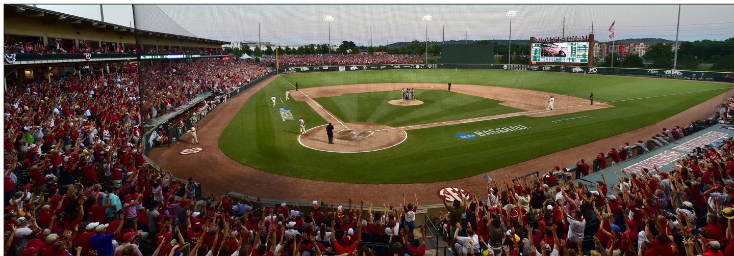
Baum Stadium hosted nine games during the NCAA Regionals and Super Regionals over the past two weeks, welcoming more fans than any other ballpark in the nation with 89,852 packing the stadium during the two rounds that saw Arkansas advance to the program's ninth College World Series. This year, the Hogs are 35-4 at home, good for the best home record in the SEC.

Going into the College World Series, Arkansas has faced the eight-team field 10 times in the regular season, seven coming in its own bracket alone. The Razorbacks swept a midweek series against Texas in March by a combined score of 20-9 and hitting a combined .359. Against Florida, split its four regular-season games with one game occurring in the SEC Tournament. Finally, against Texas Tech, Arkansas had its two-game midweek series cut down to one game due to weather, but the Hogs struck out the Red Raiders 17 times in the 5-1 victory on April 24.