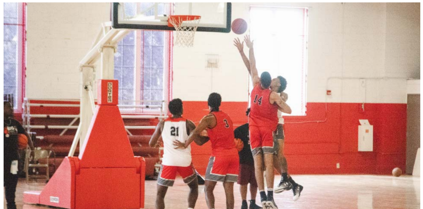
The Little Red Barn in the Memorial Health Building has been reconfigured as a practice facility for the Governors, shown here on Day One of 2018's official fall practice session.