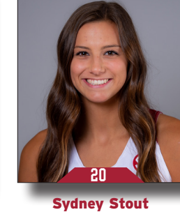
Jr | 6-0 | F Bixby, Oklahoma