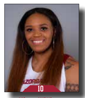
Jr | 6-1 | C Little Rock, Arkansas