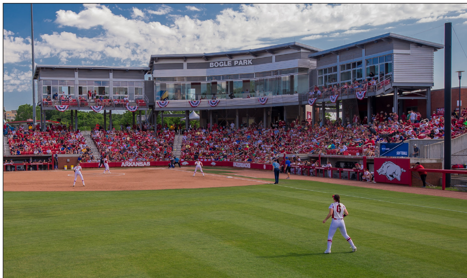
As part of the their 2019 schedule, the Razorbacks are set to play 32 home games at Bogle Park and will face 18 teams overall that played in last year's NCAA Tournament, including nine that advanced to the Super Regionals.