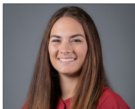
9 | AUTUMN STORMS Junior – RHP Temecula, Calif.