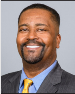
FRANK HAITH Head Coach