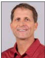
ERIC MUSSELMAN Head Coach