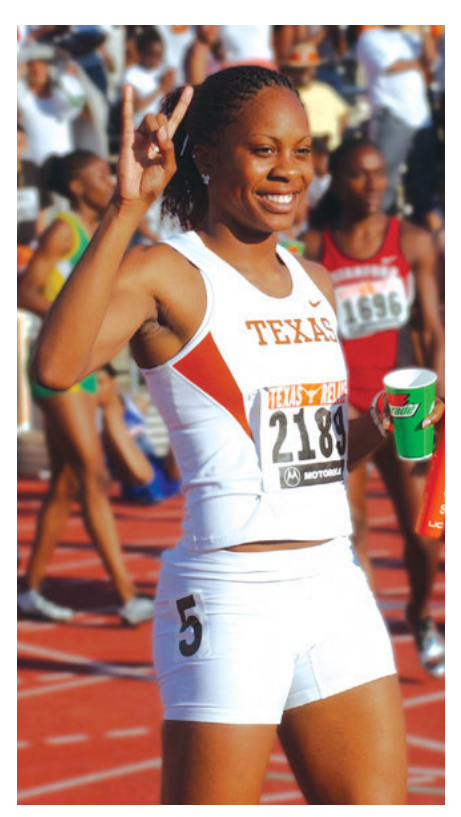
TEXAS TRACK AND FIELD LEGEND SANYA RICHARDS-ROSS IS THE MOST DECORATED OLYMPIAN IN TEXAS TRACK AND FIELD HISTORY.