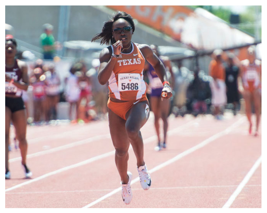
IN 2016, FORMER LONGHORN SPRINTER MOROLAKE AKINOSUN BECAME THE FIRST WOMAN IN TEXAS RELAYS HISTORY TO WIN THREE-STRAIGHT 100-METER TITLES AT THE MEET. THAT SUMMER, FOLLOWING HER HISTORIC RELAYS FEAT, SHE HELPED TEAM USA WIN GOLD IN THE 4X100-METER RELAY AT THE RIO OLYMPICS.