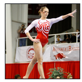
2009, while also becoming the first athlete to be meet records en route to the program's second title named to the All-SEC First Team.