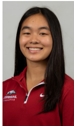
KALYXTA GAMAI AA | FR | 4-10