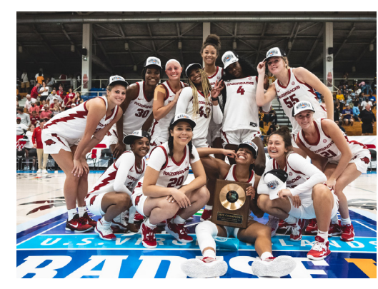
2022 Paradise Jam Reef Champions

FG Perc.: No. 8 – .536 Rebounds: 411 – 89 away from 500