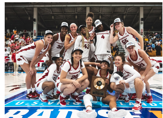
2022 Paradise Jam Reef Champions

FG Perc.: No. 8 - .538 Rebounds: 443 - 57 away from 500