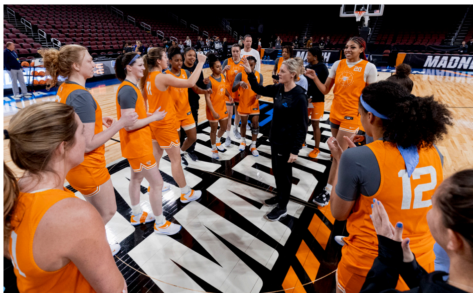
Kellie Harper has led Tennessee to back-to-back NCAA appearances, including a Sweet 16 berth in 2022.