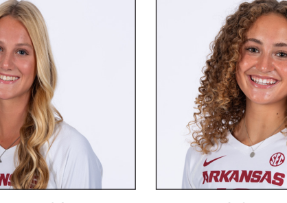
Jr. | OH | 6-1 | Fayetteville, Ark.