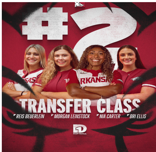
Arkansas' transfer portal class ranks No. 2 in the country, per DSoftball.