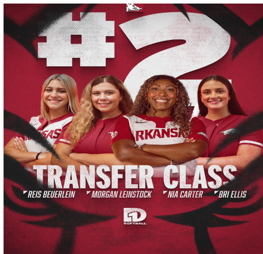
Arkansas' transfer portal class ranks No. 2 in the country, per D1Softball.