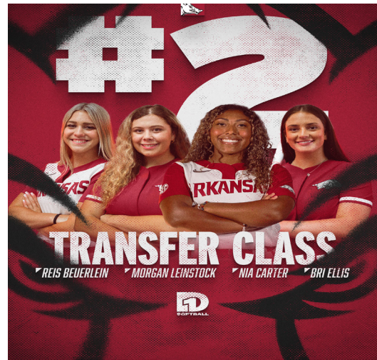
Arkansas' transfer portal class ranks No. 2 in the country, per DI Softball.