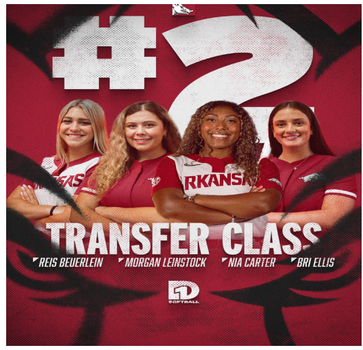
Arkansas' transfer portal class ranks No. 2 in the country, per D1Softball.

Named a top-25 finalist for TUCCI/NFCA Freshman of the Year on April