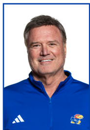
BILL SELF Head Coach 22nd Year at Kansas