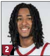
2 Boogie FLAND Arts & Sciences