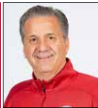
John CALIPARI Head Coach