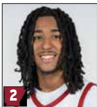
2 Boogie FLAND Arts & Sciences