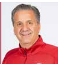
John CALIPARI Head Coach