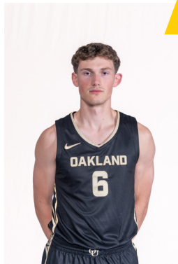
GUARD 6-5 // 185