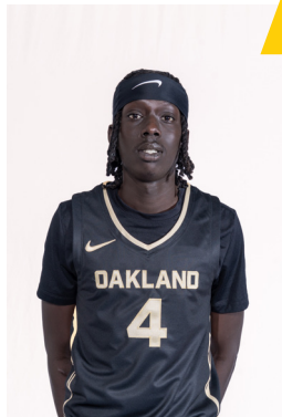
GUARD 6-2 // 153

One of 10 pair of twins to play on the same team in DI