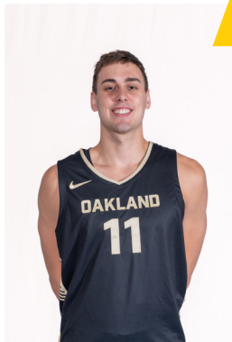
GUARD/FORWARD 6-7 // 205