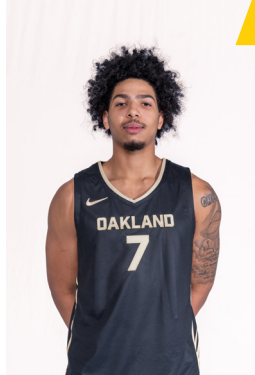
GUARD/FORWARD 6-7 // 229