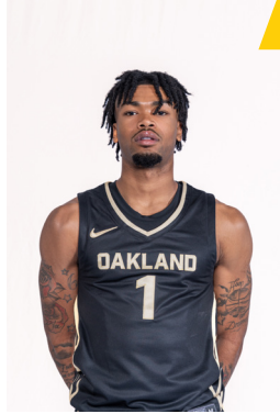
GUARD 6-0 // 156