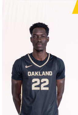
FORWARD 6-9 // 192