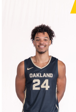
FORWARD 6-5 // 211