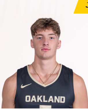
GUARD 6-3 // 185