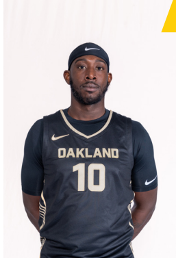
GUARD 6-3 // 222