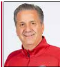
John CALIPARI Head Coach