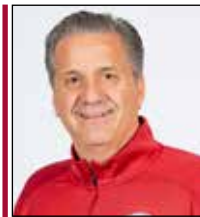
John CALIPARI Head Coach