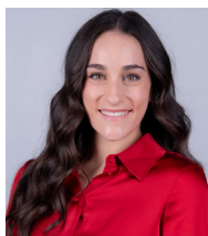
JORDYN WIEBER HEAD COACH