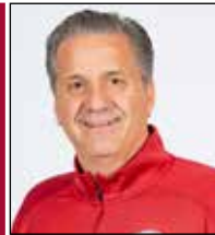
John CALIPARI Head Coach