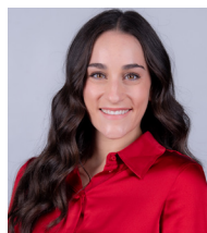
JORDYN WIEBER HEAD COACH