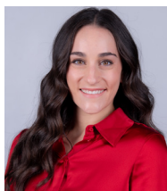
JORDYN WIEBER HEAD COACH