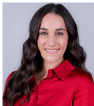
JORDYN WIEBER HEAD COACH