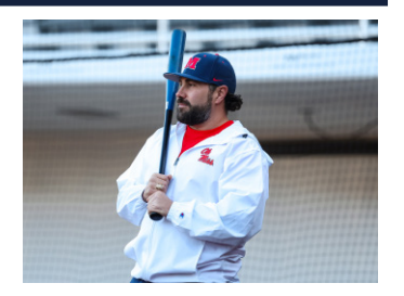
Bobby Buchanan Dugout